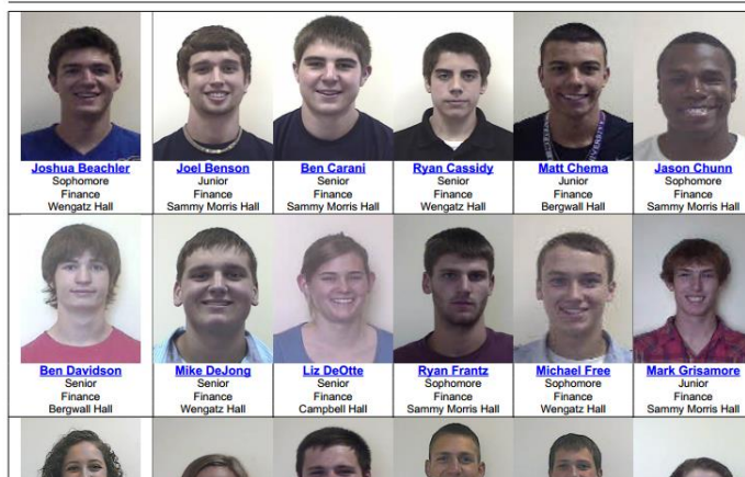
Spring 2013 Primary Advisees for Adams, Scott AS of 08/13/13

Note: If the email list is too long, a red box will appear around the email icon indicating it will open an Excel file when clicked on that contains the email list. The list can be copied directly over into a mail program to be sent. For further help, click on the help icon next to the email icon.